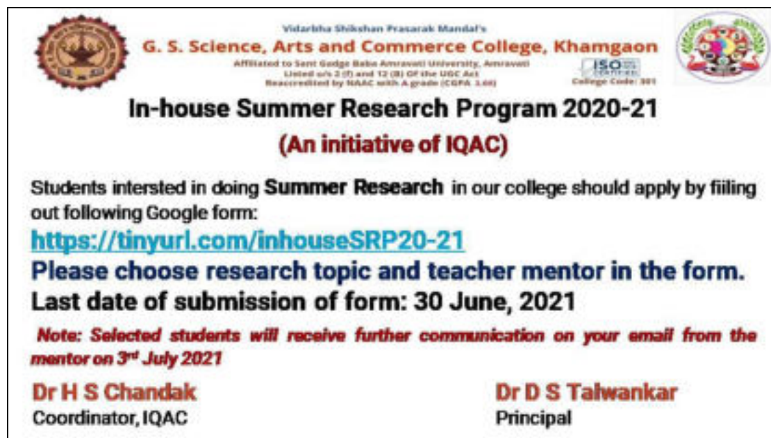
Snapshot 1: Brochure of the In-House Summer Research Program

A few students were shortlisted based on their academic record and availability of IT infrastructure with them. Summer research program was successfully completed under following seven mentors: