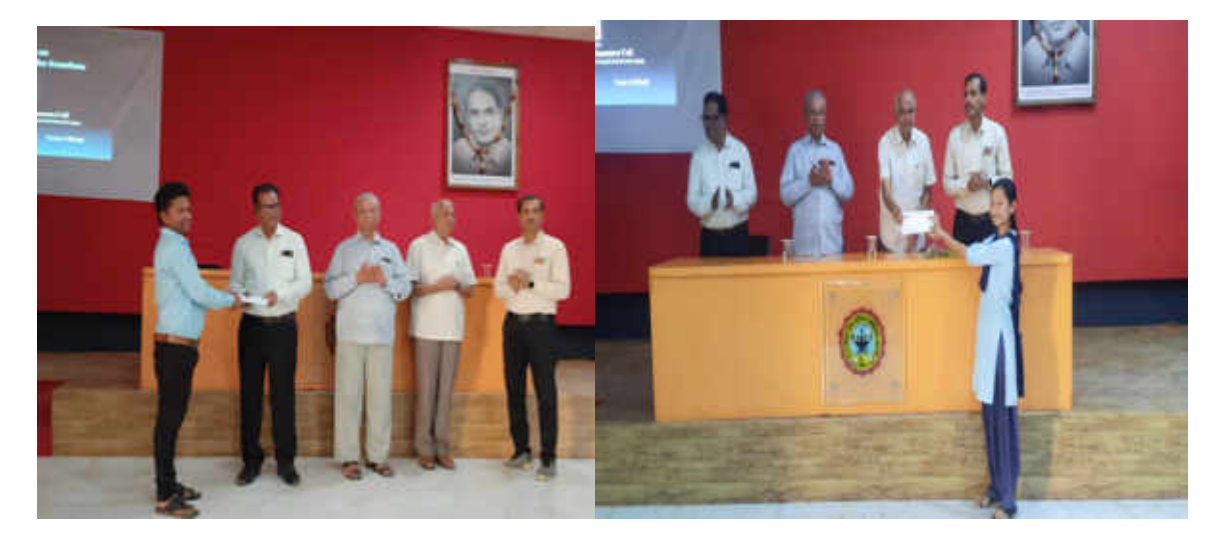
Scholars hip distribution to the scholars who completed In-house Summer Research during 2021-22